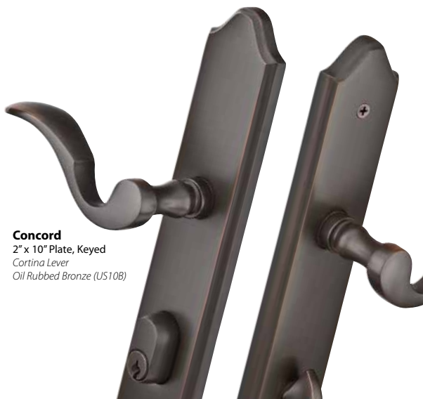
Concord 2" x 10" Plate, Keyed Cortina Lever Oil Rubbed Bronze (US10B)