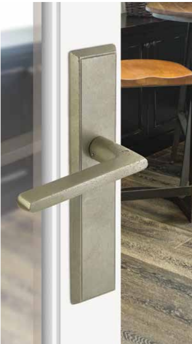
Rectangular 1½" x 11" Plate, Keyed, Cimarron Lever, Medium Bronze (MB) Rectangular 2" x 10" Plate, Non-Keyed, Lariat Lever, Tumbled White Bronze (TWB)