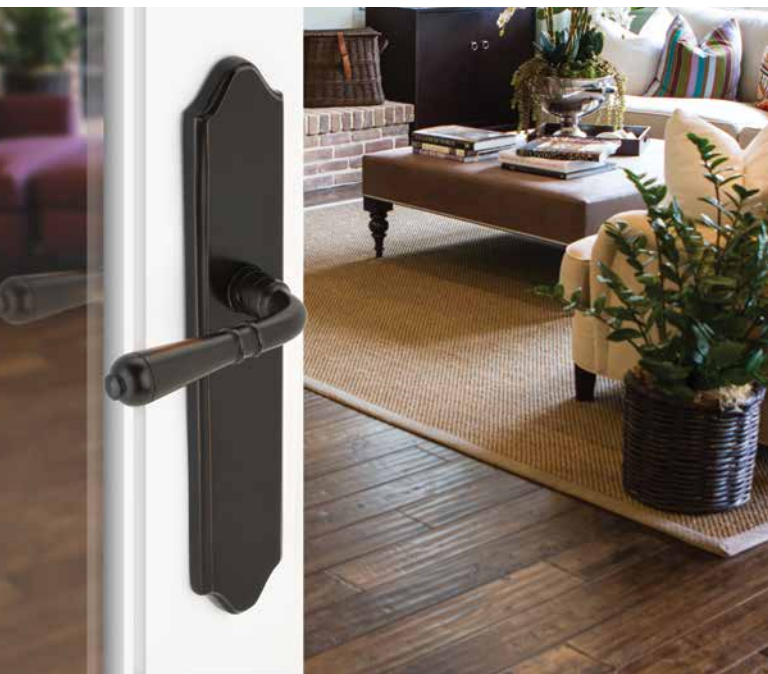
Concord 2" x 10" Plate, Non-Keyed, Turino Lever, Oil Rubbed Bronze (US10B)