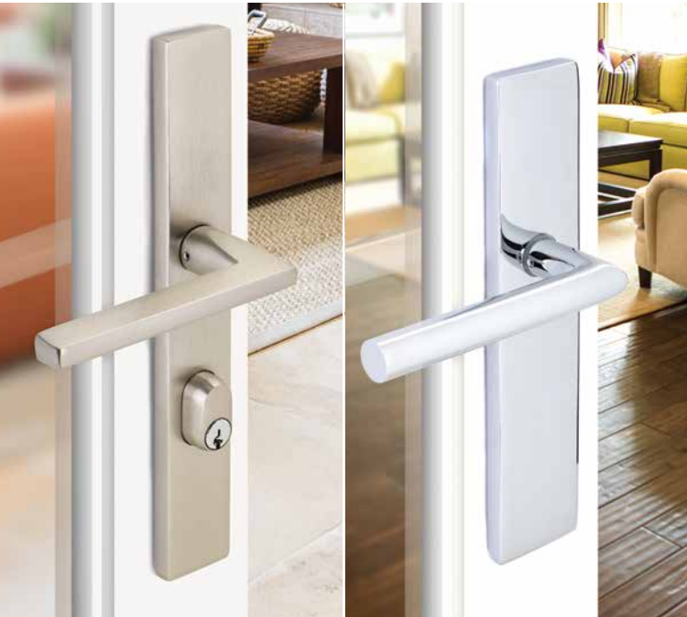
Modern 1½" x 11" Plate, Keyed, Helios Lever, Satin Nickel (US15) Modern 2" x 10" Plate, Non-Keyed, Stuttgart Lever, Polished Chrome (US26)