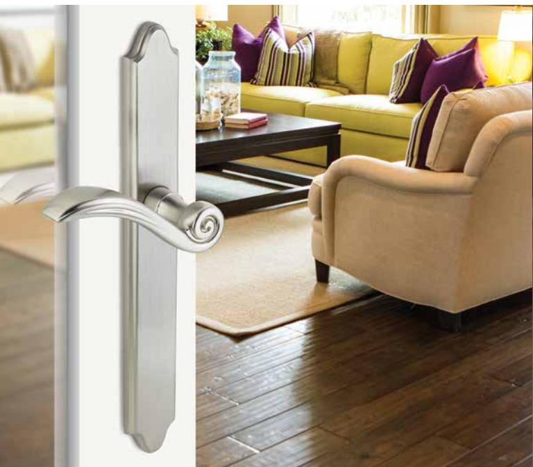
Concord 1½" x 11" Plate, Non-Keyed, Elan Lever, Satin Nickel (US15)