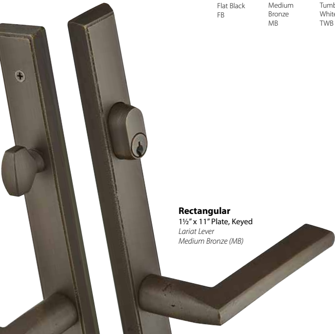
Rectangular 1½" x 11" Plate, Keyed Lariat Lever Medium Bronze (MB)