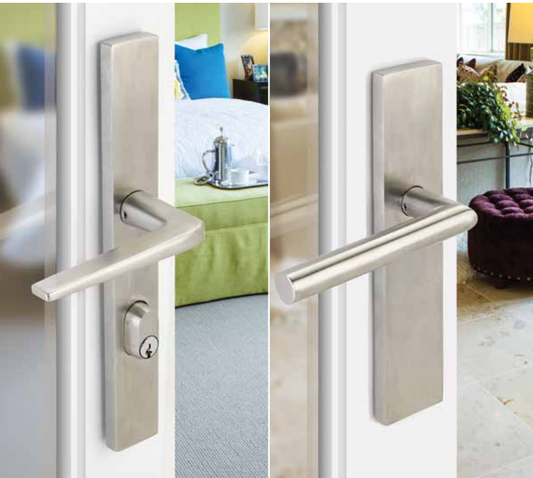
Stainless Steel 1½" x 11" Plate, Keyed, Athena Lever, Stainless Steel (SS) Stainless Steel 2" x 10" Plate, Non-Keyed, Stuttgart Lever, Stainless Steel (SS)