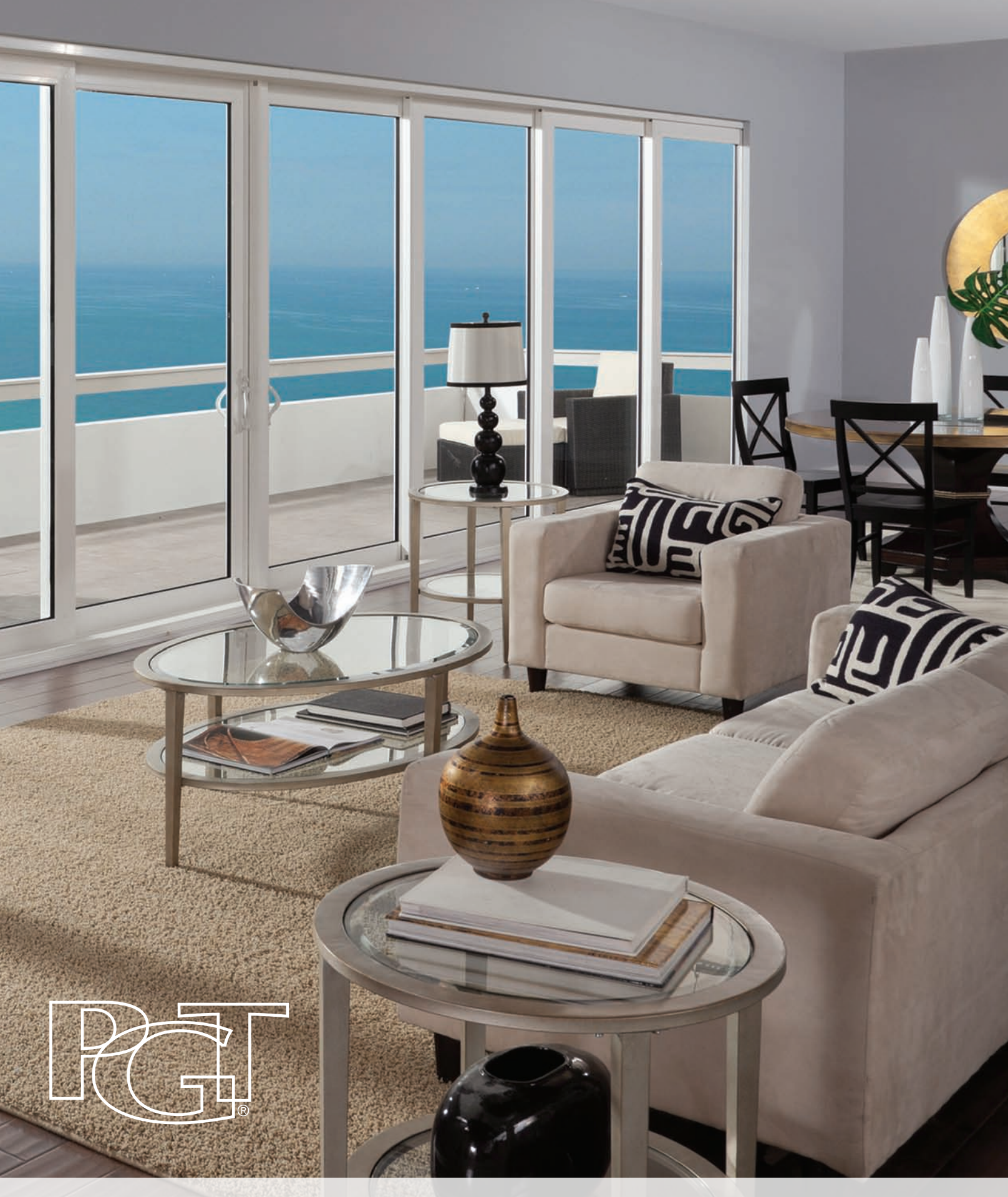
The Industry Leader for a Reason.