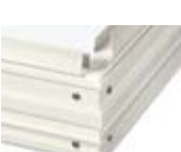
Sheetrock Return, 3/4" Receiver and J-channel provide easy finishing.