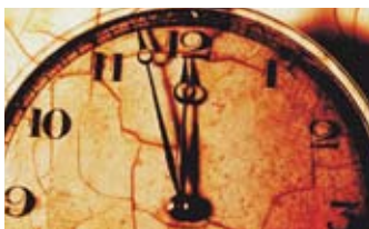
Fast consistent delivery allows for scheduling flexibility on any project.

Stay flexible! Integrity's amazing delivery lets us be flexible to your specific needs. Our delivery allows us to batch your order, perform direct drops, deliver within a specified week and respond to unforeseen changes that might threaten to delay your project - now that is flexibility that can benefit any project.