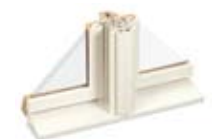
Factory mulling reduces on site labor and eases installation.

Wood-Ultrex products have the same durable Ultrex construction and exterior as our All Ultrex products, but feature rich finely milled pine interiors. Wood-Ultrex windows and doors feature five hardware finishes, five exterior colors, numerous grille options and configurations, and an array of sizing options. Wood-Ultrex products are ENERGY STAR qualified, NFRC rated and have received Hallmark Design Pressure certification from the WDMA.