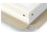
Pre-attached Folding Nailing Fin for easy installation.