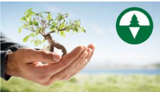
Contributes to 6 LEED residential program categories which deliver a total potential point value of 6 points.