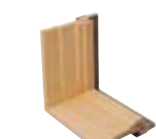
Factory-applied Jamb Extensions save time and labor.