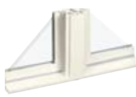
Factory mulling reduces on site labor and eases installation.

All Ultrex windows and doors feature exceptionally durable Ultrex interiors and exteriors for the ultimate in low maintenance performance. All Ultrex windows feature a 2" jamb depth, an array of sizing options, white interiors and six exterior finishes, including; Stone White, Cashmere, Pebble Gray, Bronze, Evergreen and Ebony. All Ultrex products are ENERGY STAR qualified, NFRC rated and have received Hallmark Design Pressure certification from the WDMA.