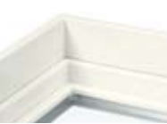
Factory-applied Jamb Extensions save time and labor.