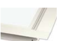
Frame Expander provides flexibility.