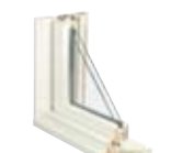
Factory-applied White Pre-Finish (interior) reduces job site finishing.